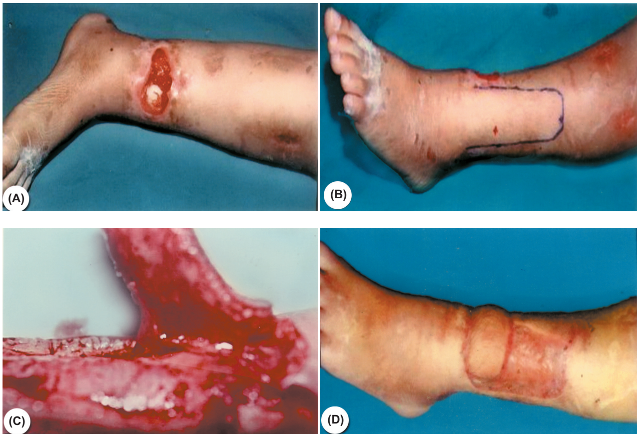
Fig. (1): (A) Post-traumatic soft tissue defect over the distal part of tibia that is exposing the underlying bone in 36-years old woman. (B) Design of the flap. (C) Elevation of the flap. (D) Final result 3 months later.

The follow-up period ranged from 1 to 3 years. In general, the texture, thickness and color of the flaps matched the surrounding, and patients were satisfied with the results. The thickness of the flap was suitable to cover the dorsum of the foot, medial and lateral malleoli (Figs. 1,2,3).